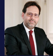
Mr. Matthias Fekl President the International Chamber of Commerce - France