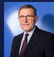
Mr. Gérard Mestrallet Special Envoy of President Macron for the India - Europe Economic Corridor (IMEC) - France