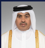
H.E. Mr. Ali bin Ahmed Al Kuwari Minister of Finance Qatar