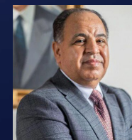
H.E. Dr. Mohamed Maait Executive Director IMF - Washington D.C.